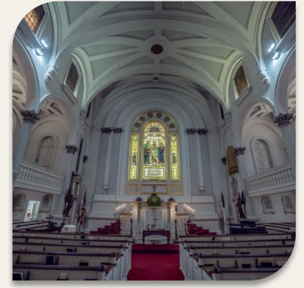
Old Dutch Church 272 Wall Street, Kingston