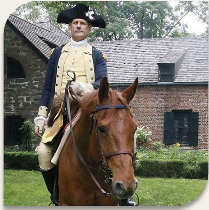
Senate House State Historic Site 296 Fair Street, Kingston