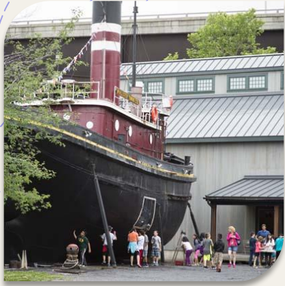
Hudson River Maritime Museum 50 Rondout Landing, Kingston