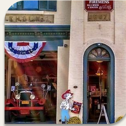
Volunteer Firemen's Museum 265 Fair Street, Kingston