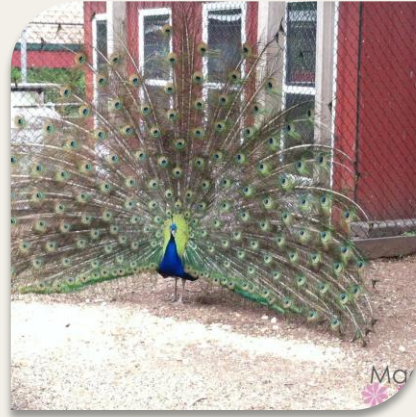
Forsyth Nature Center 125 Lucas Ave Ext, Kingston